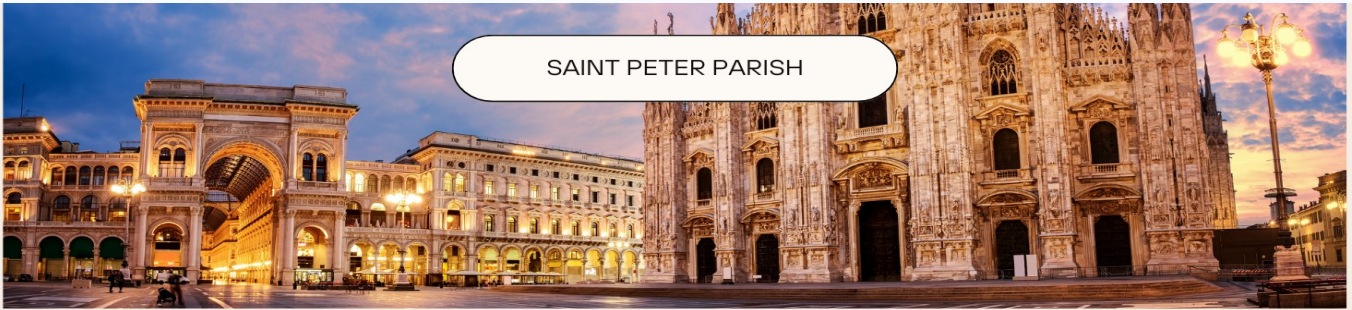
SAINT PETER PARISH

It's that time again, we will be collecting boxes of Cereal (hot and cold) in support of Whitehall-Coplay Hunger Initiative. Containers are located in the main vestibule and the elevator vestibule. This collection will take place now